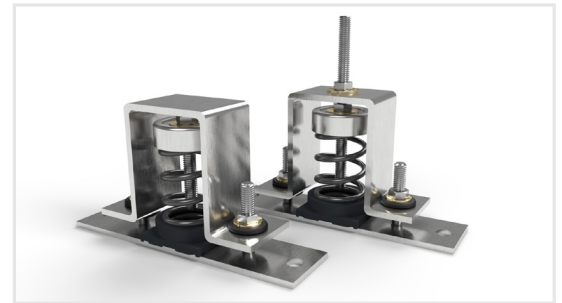
Assembled VIBmount-HS Isolator

VIB-ISO will engineer each VIBmount-HS isolator to match your specified unit and meet any additional customer requirements. The VIBmount-H isolator is available in either 1" or 2" deflection and is shipped fully assembled in order to reduce onsite labor requirements. The springs are made of structural steel and sit on an elastomeric mount. The housing is made entirely of structural steel and is available for fully-welded or fully-bolted applications.