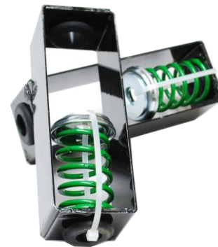
Figure 2 - VISH shown as delivered with zip ties